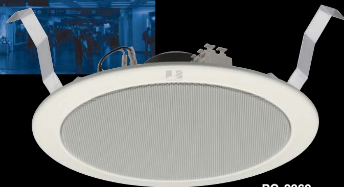
PC-2369 Not Available in Canada