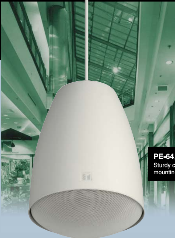
PE-64/304 Pendant Speaker

Supplied brackets ensure flexible speaker direction changes.