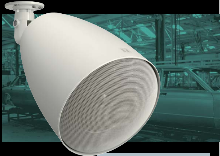
PJ-64/304 Projection Speaker

High sound pressure level of up to 30W input ensures excellent sound reproduction in high-ceiling and wall-mount applications.