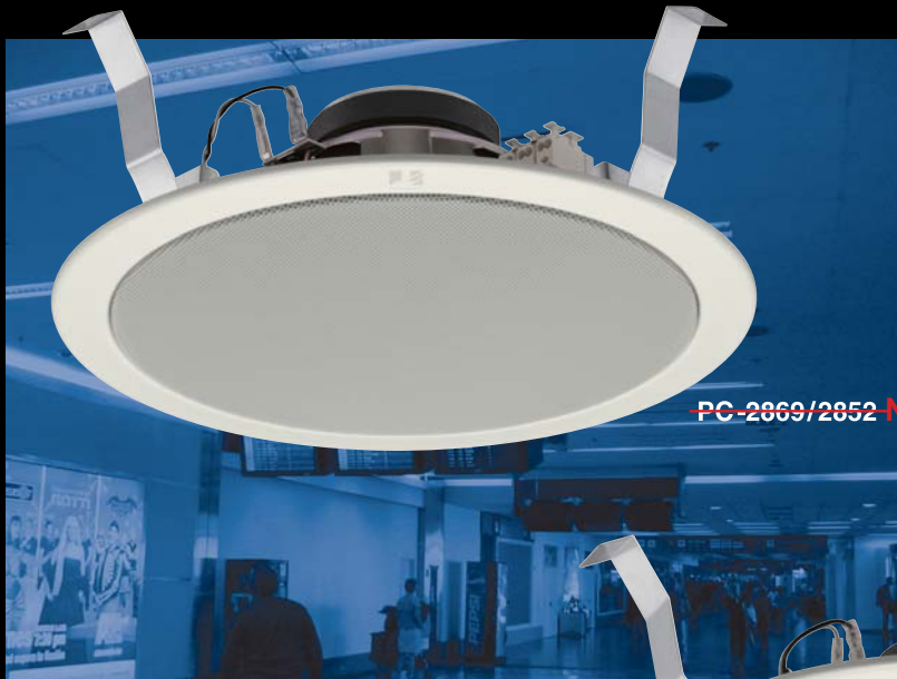
PC-2869/2852 Not Available in Canada

Finely crafted design with thin panel that does not detract from venue architecture or interior decor.